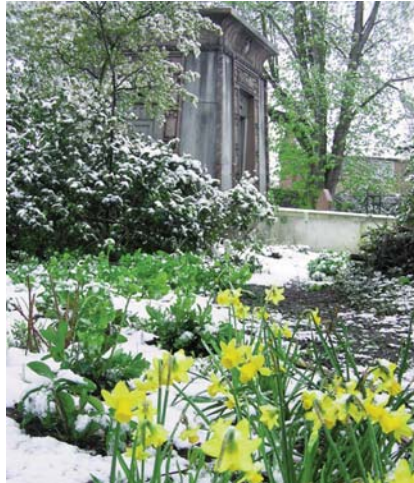
Kilmorey Mausoleum in spring

Plans for Kilmorey during 2009 are now well advanced. In addition to the traditional opening as part of the capital-wide Open House weekend in September there will be another open day on 6th June when, it is hoped, the garden's wildlife features will be seen at their most attractive.