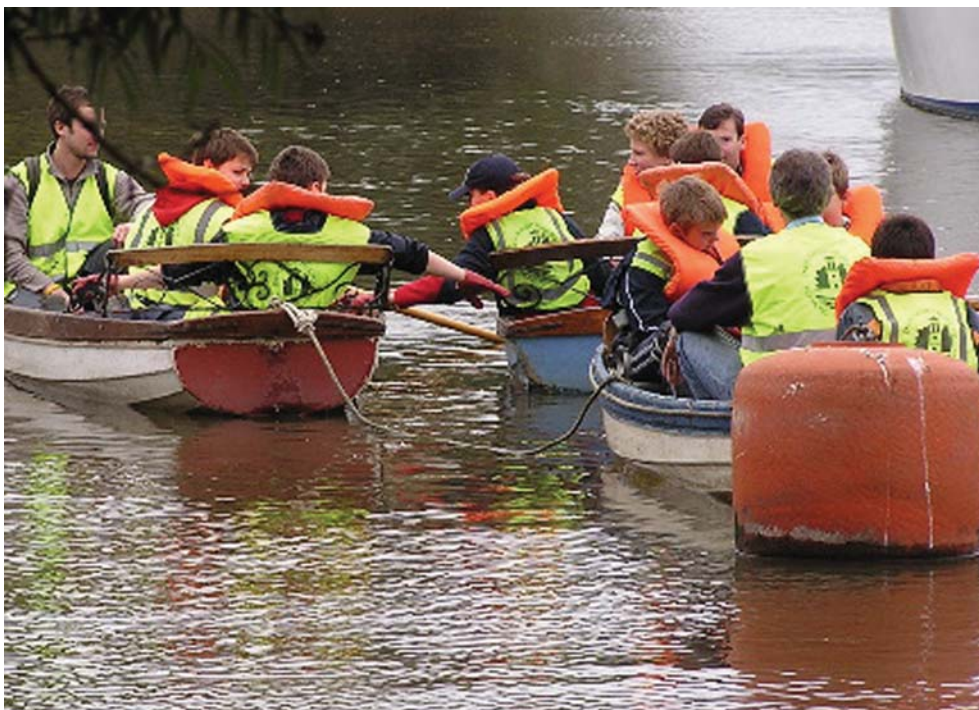
The River Centre will bring river access and education to everyone, young and old

We are now reaching a critical point in the evolution of the River Centre project – part of the regeneration of the former Twickenham pool site – as tenders for the development of the whole site are soon to be submitted from the three chosen developer teams. This is the most high-profile and potentially the most rewarding project that the Trust has ever been involved in.