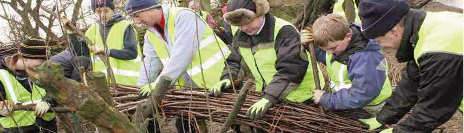
Environment Trust volunteers learning willow spiling to protect the riverbank at Kew.